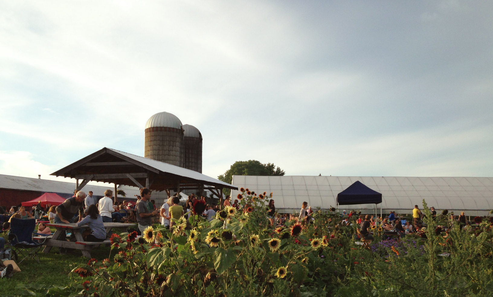
Burger Night at Bread & Butter Farm.