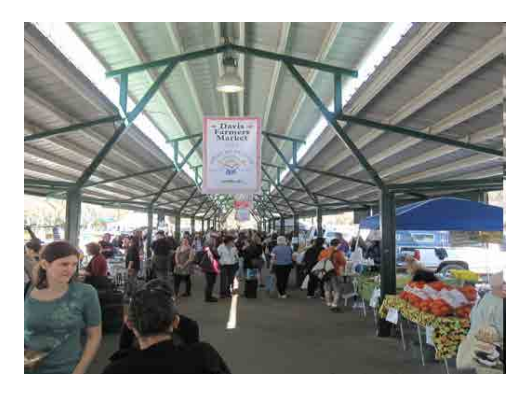
Davis, California farmers' market.

California, the city built a roofed pavilion over their farmers' market, which is located on the edge of a large park directly adjacent to the downtown stores and restaurants. The place hums with activity when the market is open – and families can picnic in the park on food they've just bought at market. The market—developed in a