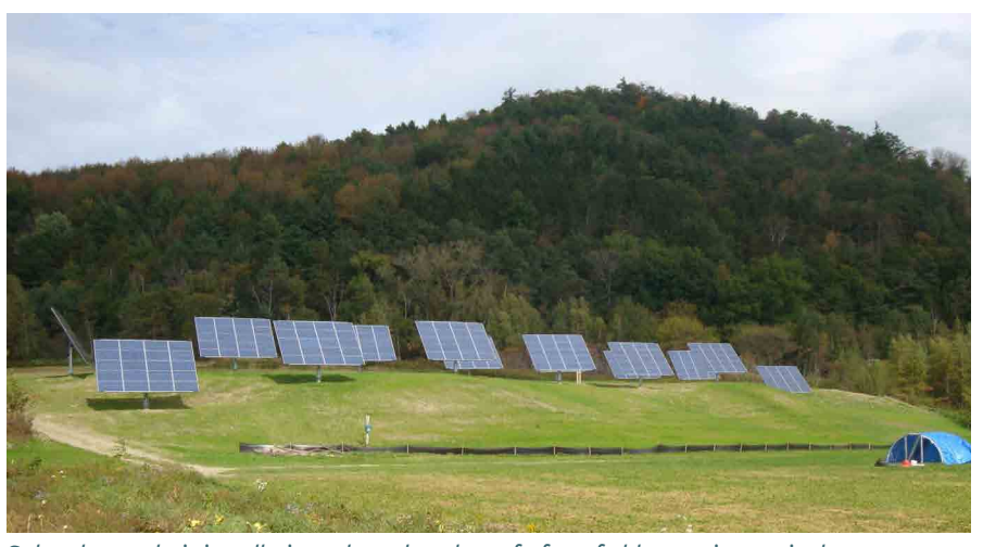
So lar \ photovoltaic \ installations \ along \ the \ edges \ of \ a \ farm \ field \ are \ an \ increasingly \ common \ sight.

municipal and regional plans by providing clear guidance regarding the appropriate locations for large system installations—after working through related issues with affected landowners—can help support renewable energy development by making the permitting process less contentious and more predictable, and help preserve the best farmland for agricultural use.