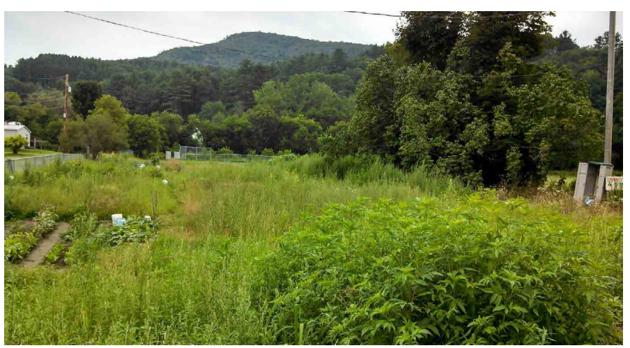
Given a lack of easy access to water, only a few stalwarts remain active in Royalton's community garden by midsummer.

convenient location, with a roof and water and utility hookups—has created an economic boost for the downtown. By contrast, locating a community garden distant from a water source, playground or parking area can hinder its success.