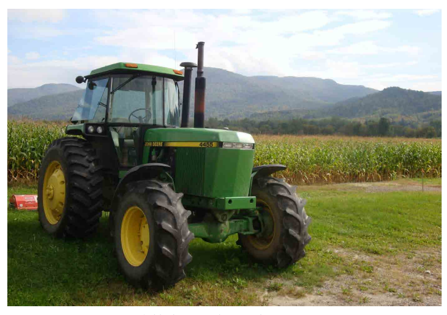
Tractor next to Vermont cornfield.

The scope and focus of a CFA will vary depending on staff capacity, community capacity, and funding but should be conducted so that the result is a picture of existing food system components – and associated assets and weaknesses – which form the basis for recommended improvements.<sup>5</sup>