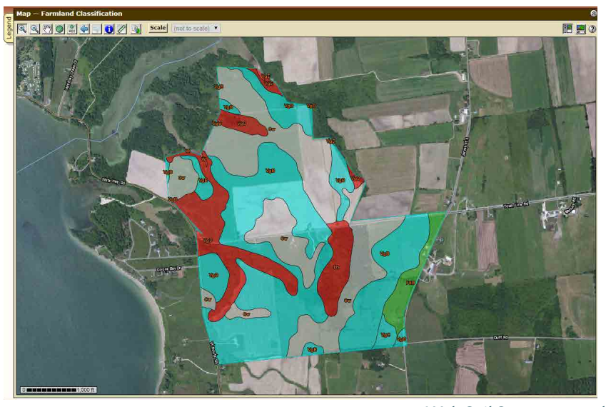
Web Soil Survey example.

If mapped primary agricultural soils are present on the site, the applicant should contact the Agency of Agriculture, Food, and Markets' Act 250 specialist "early in the process so that the Agency's comments can be included" with the application. The Agency provides a soil review letter that becomes part of the application for the district commission's consideration, and provides the Agency's