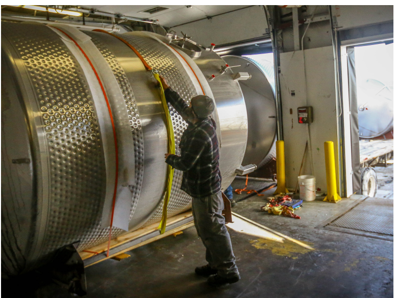
HARD CIDER MANUFACTURING

Qualities that employers look for when hiring in this field include analytical skills, critical thinking, problem solving skills, interpersonal skills, and speaking skills. Technical assistance workers must analyze client portfolios and are constantly working with numbers. Professionals in this career interact