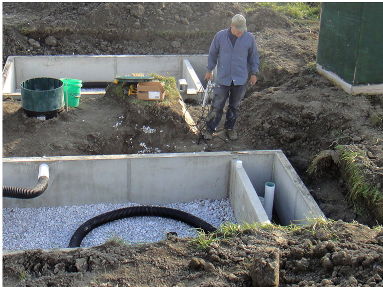
INSTALLING WATER QUALITY TECHNOLOGY, CREDIT NRCS.

Apply knowledge of engineering technology and biological science to agricultural problems concerned with power and machinery, electrification, structures, soil and water conservation, and processing of agricultural products.