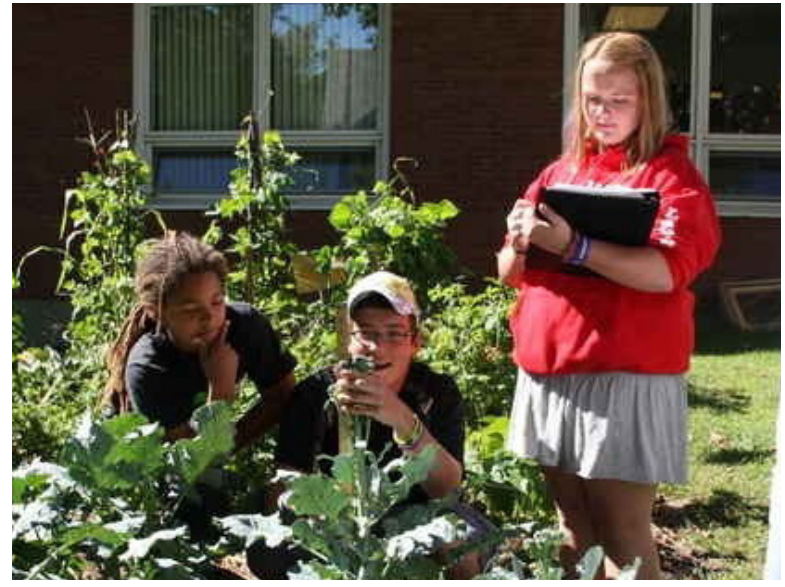
NORTHFIELD HS STUDENTS GARDENING

Educators work in many different contexts, throughout all grade levels and even outside the formal school setting. Grade school teachers work full-time and often spend time outside of school hours grading papers and preparing lessons. Grade school teachers work the 10-month school year and have a 2-month break during summer, during which they may teach summer programs. Postsecondary teachers work both full-time and part-time. Part-time postsecondary teachers often have a full-time job in their field of expertise in addition to their teaching position. Postsecondary teachers can have