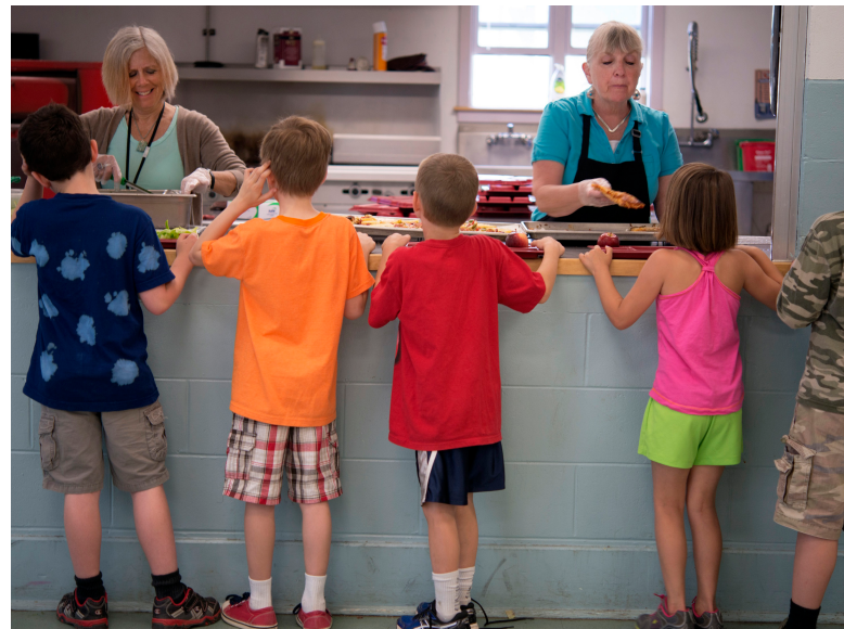
MONKTON CAFETERIA LINE

Food service managers or other food service workers in a school or healthcare setting.