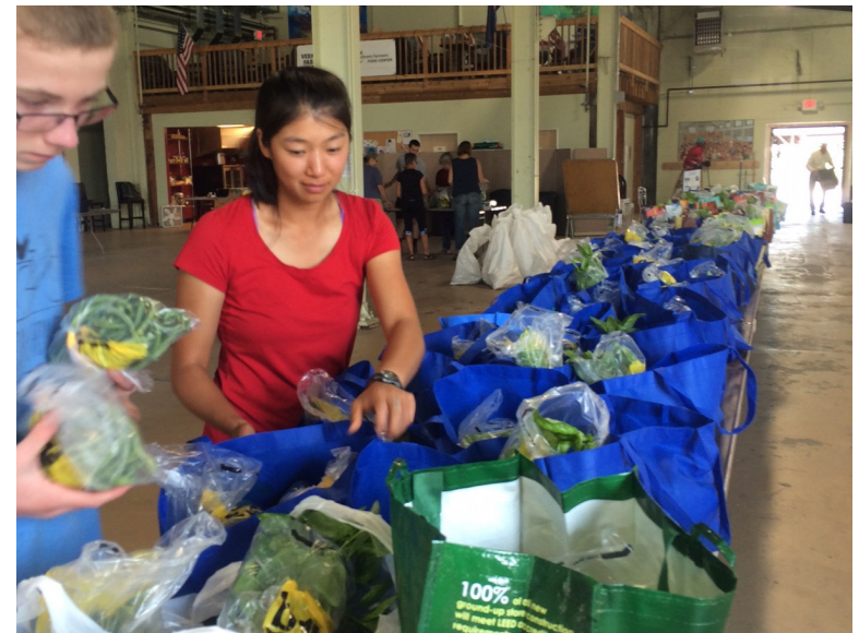
PACKING HEALTH CARE SHARES

Qualities that employers look for when hiring in this field include compassion, communication skills, interpersonal skills, organizational skills, and problem-solving skills. Food organization staff advise clients regarding food stamps and money management when shopping for food, oversee individual volunteers,