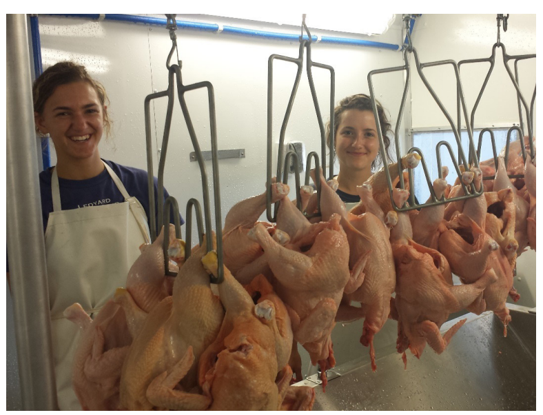
STUDENTS AT HANNAFORD CAREER CENTER