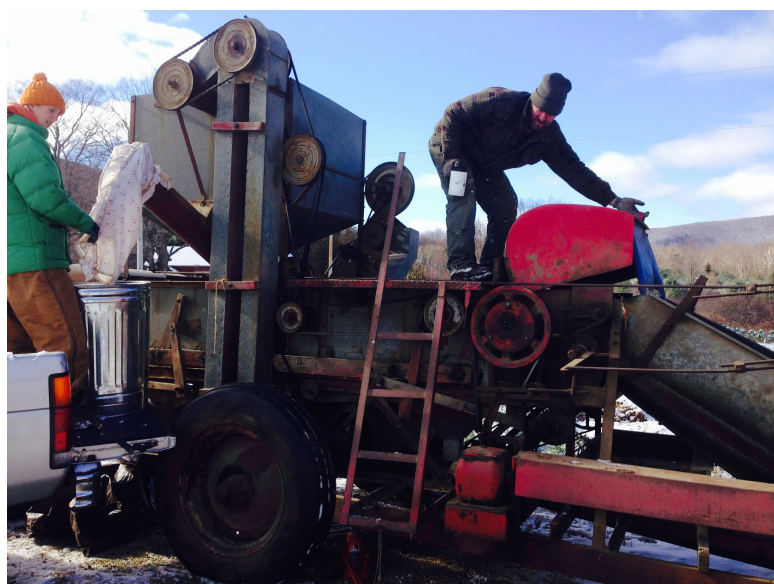
FARM MACHINERY IN USE AT YODER FARM

Diagnose, adjust, repair, or overhaul farm machinery and vehicles, such as tractors, harvesters, dairy equipment, and irrigation systems.