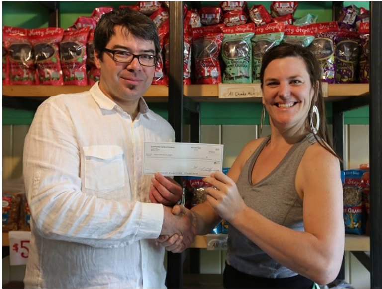
COMMUNITY CAPITAL OF VERMONT

Qualities that employers look for when hiring in this field include decision making skills, interpersonal skills, and detail orientation. Loan officers must analyze client portfolios and are constantly working with numbers. Loan officers interact with clients often and must be able to make