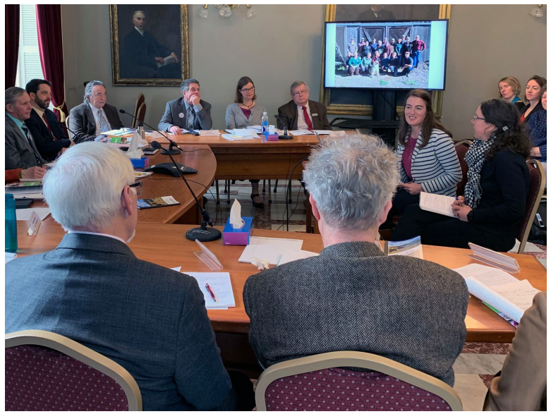
TESTIFYING TO THE VT STATE LEGISLATURE AG COMMITTEES

Employees or consultants who engage in advocacy or support community activism related to food and agriculture issues, for example employees of an anti-hunger nonprofit.