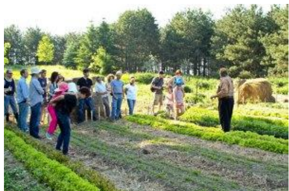
Dinner on the Farme at Garden Farme

His desire to continue Garden Farme extends beyond personal reasons; it is very unique to the area. It is a small scale certified organic operation with a focus on stewardship of the land. The diversity of land types on the site provides almost limitless agricultural uses, and would be an excellent location for an agricultural incubator, serving as a small regional economic generator.