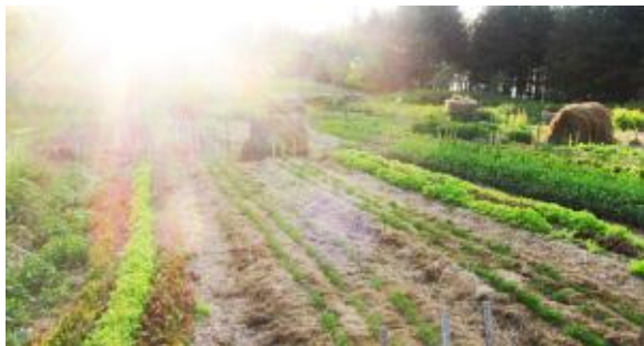
Raised Beds at Garden Farme

early 20 th Century. In 1977, Garden Farme was certified organic. The farm features two acres of raised beds for herbs and leafy greens. To complement the organic greens production, the remaining acres are used for growing potted trees, mushrooms, nuts, fruits, and honeybees. Additionally, the property has 25 acres of restored prairie and 16 acres in the Conservation Reserve Program. The products from Garden Farme are sold directly to local chefs, caterers, and cooperatives. Garden Farme also hosts many special events including permaculture education, Dinner on the Farm, and others.