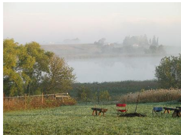
Foggy Marshwatch Farms

Whether they need a mobile home on the property or a few seasonal cabins, deciding what exactly is needed to support the CSA should be Marshwatch Farms first step. Preparing a rough sketch of the property with current and future planned buildings and a professional document about the farm and the needs it has, can be taken to the Planning and Zoning department in Scott County to provide a visual and reasoning behind the permit application. Marshwatch Farms must be flexible in design, location, and function as they move through the planning and zoning process.