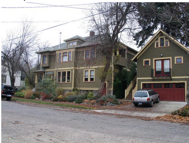
Attached ADU above a garage.

Agricultural zoning districts can be used to direct how and where future development occurs. With agricultural zoning it is common to see large lot sizes (one unit per twenty acres or larger) and restriction on uses. Major overhauls to agricultural zoning ordinances may see pushback from farmers because much of their livelihood is dependent on the use of their land. To ensure agricultural zoning is legally sound, the zoning authority should communicate how the ordinance serves the public good and is backed by a current comprehensive plan. Furthermore, the zoning cannot result in a regulatory taking of the property and thus should be reasonable, inclusive, and fair (Bowers & Daniels 1997).