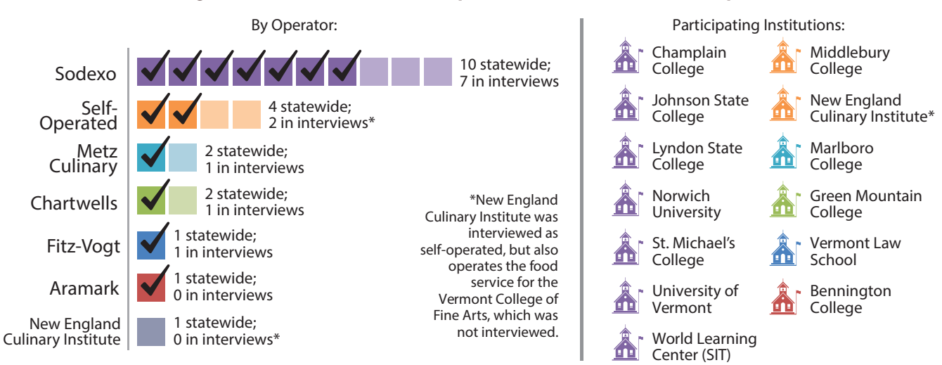
Of a total of 21 Higher-Education Food Service Operations in Vermont, 13 Participated in Interviews:

Conner then developed an interview guide, which asked about the use, efficacy and feasibility of the recommendations drawn from the literature (see Appendix). He conducted interviews with individuals (some interviews were with multiple people from an institution) from 13 of Vermont's 21 higher education food service operations (see page 7 for a complete list). Additionally, he interviewed a staff person dedicated to a single food service management company's statewide local food initiative. Of the 13 institutions interviewed, 2 (15%) operate their food service independently and 11 (85%) contract a food service management company to do so. The breakdown of the food service management companies represented in the interviews, along with a comparison to the representation of food service management companies in higher education institutions statewide, is displayed below. The interviews were coded for common and emergent themes. All responses are self-reported by interviewees.